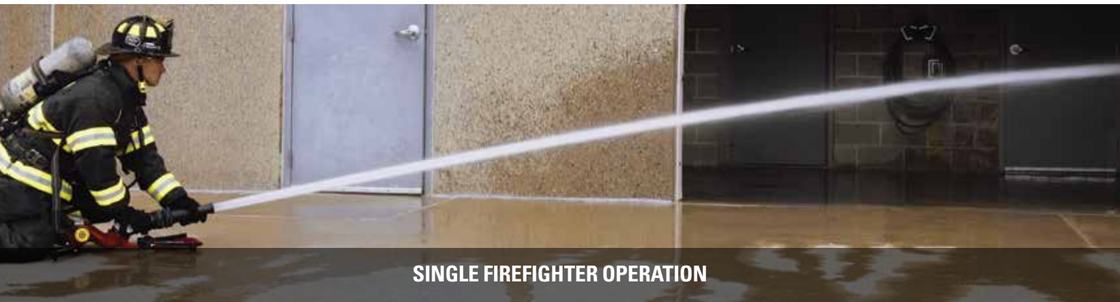
SINGLE FIREFIGHTER OPERATION